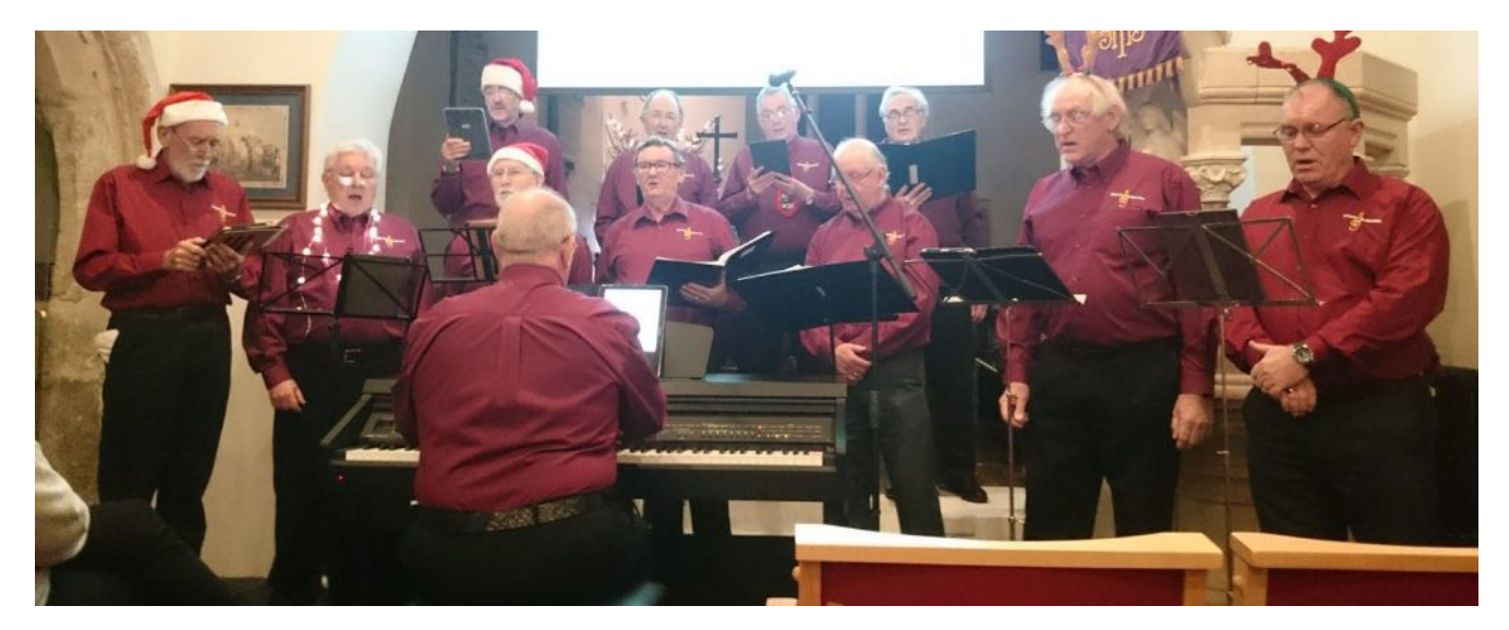
The Christmas concert thoroughly entertained the full audience - and raised funds for "Give the Boys a Lift"