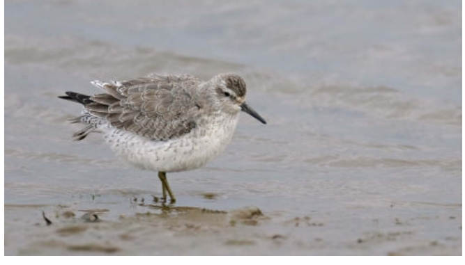
The knot - an unusual sighting on the upper reaches at Llangwm.

Waders have included redshank, greenshank, dunlin, blacktailed godwit, snipe, oystercatchers and curlew. There were occasional sightings of common sandpipers (not as common as their name suggests). Also, on 24 February, three knots were seen feeding along the tideline at Llangwm Ferry in the company of a large group of 53 blacktailed godwits. Although knots are present in the lower reaches of the waterway (Angle Bay and the Gann) it is very unusual for them to be seen this far upstream. Lapwings were ever present from mid-October until the end of February when they departed for their breeding grounds.