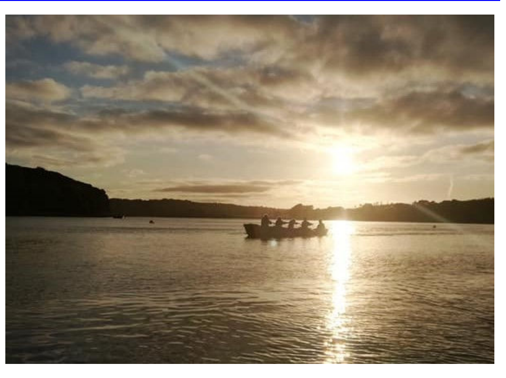
Llangwm rowers enjoying the sunset on a calm evening at Hook Quay

through the Rowing Club Facebook page and the village Facebook page.