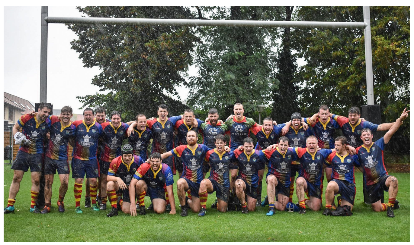
The rugby squad from Beernem, Flanders, were poised to come and do battle with Llangwm First XV on Easter Sunday...alas, no longer possible. With Beernem Rugby Club all of 5 years old and Llangwm established for well over 130 years it was to have been a David versus Goliath encounter. We send greetings to the Belgian club in advance of some future opportunity to meet up, in more optimistic times.

We very much regret that the 2020 Llangwm Literary Festival has had to be cancelled in the light of the ongoing coronavirus situation