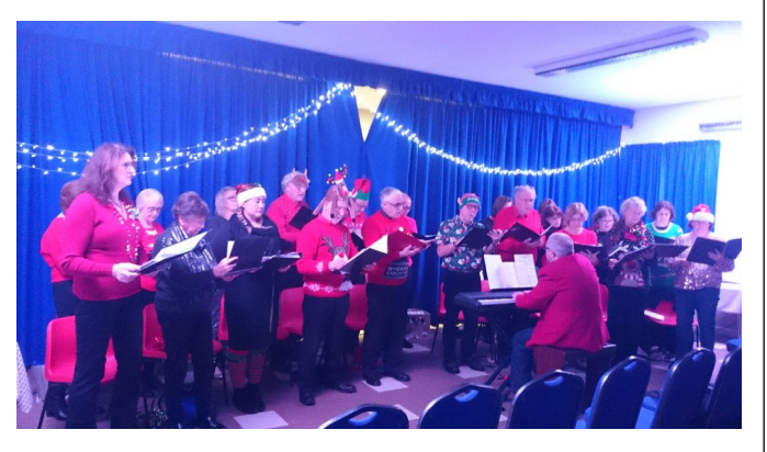
In merrier times...Llangwm Village Voices in full dress rehearsal just before their Christmas extravaganza in the village hall -"A Not So Silent Night"