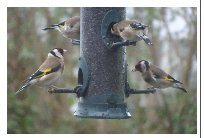
Goldfinches are to be seen in abundance at the moment around garden feeders. Niger seeds seem to be their favourite food...whereas the tits prefer peanuts.

On 17 November a blackcap was observed in one of our apple trees and on 5 February the unmistakable call of the chiffchaff was heard in the garden. Both these warblers are usually spring/summer visitors but they are known to occasionally overwinter in areas where the weather conditions are less harsh.