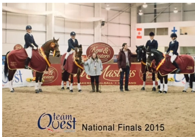
The "Pembrokeshire Lunachicks" - the Haverfordwest-based team which carried off the national trophy.