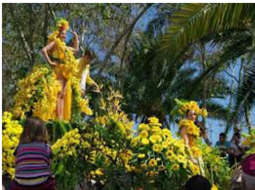
Madeira Flower Festival