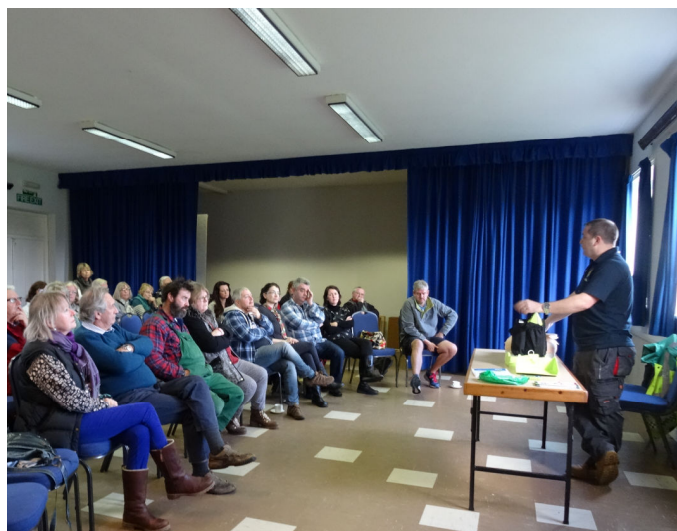
A good turnout for the all-important defibrillator demonstration at the Village Hall in January.

Next year there will be a repeat demonstration once the defibrillators are installed in the village, but there is plenty of information about how to operate them on the internet, so please do look. 'Staying Alive....'