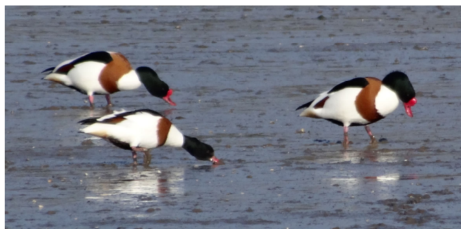
Top: Shelduck. Below: Lapwing and Dunlin on the shore at Llangwm Ferry Point

Over the last month or so there have been upwards of 20