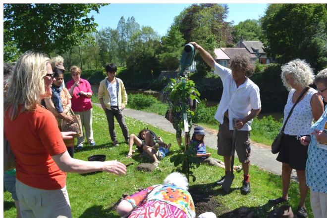
First fruit tree planted by the Orchard Mawr group, part of Transition Haverfordwest, at the 2012 Green Fayre.

The group meets regularly to plan tree planting - on publicly accessible land. In 2012 a 'Green Fayre' was held on Picton Fields, when the first fruit trees were planted along the