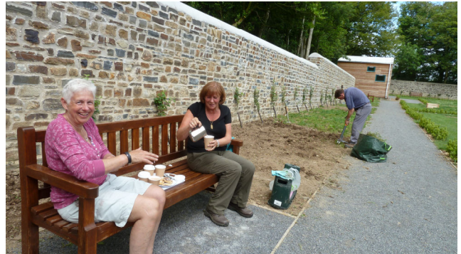
Scolton Walled Garden

Rebuilding Project. It is now such an impressive area at the back of the manor house, with a lot of history - a lovely addition to the site. A group of Garden Club members formed a weed-bashing and planting working party last June, who did 2 days hard labour in the garden to tidy the enormous lengths of beds, fortified only by tea and biscuits, lavishly supplied by the Scolton Café staff!