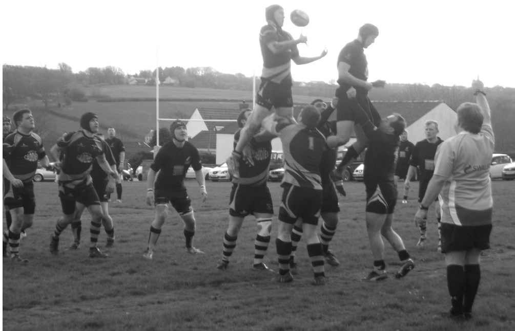
High jinks! at Llangwm's recent First XV game against Neyland at Llangwm's home ground of Pill Parks. 22nd March 2014.