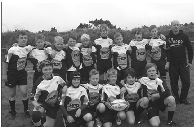
Some of Llangwm's enthusiastic Under-13s in their smart black-and-amber strip sponsored by Hook Construction Partnership.