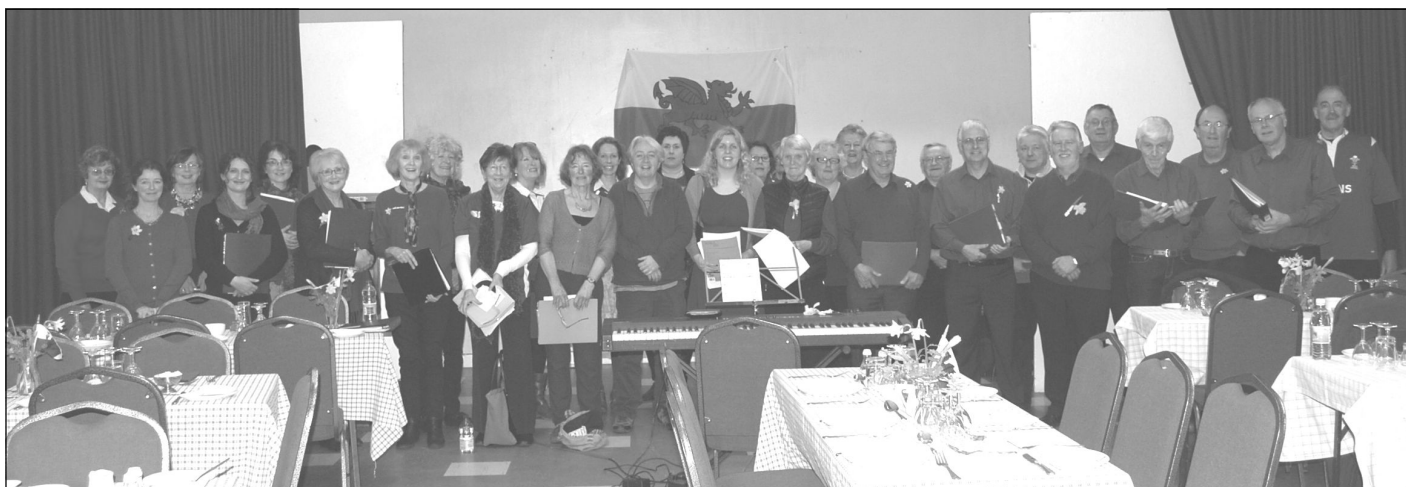
Llangwm Village Voices choir were in fine voice and party spirit at the recent St David's Day Supper and Entertainment Evening at the Village Hall.

(*Latest information: the St. Mary's concert is to be held on 23rd May while a Llangwm Rugby Club charity concert will be held on 17th July)(to be confirmed).