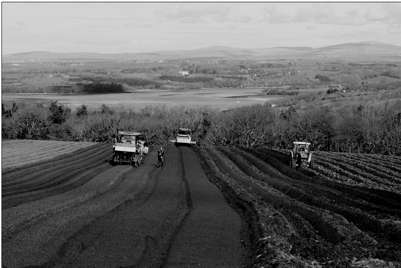
The farming year gets into full swing with the planting of potatoes. - a field with a view, above Benton Wood looking towards the Preseli Hills.